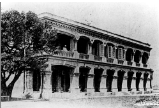
Figure 4: Close-up of the 1883 Hong Kong Observatory building, taken in 1913 (courtesy Hong Kong Observatory).

Let us briefly take a look at the background to the new institution that Doberck was about to lead. Within the first thirty years of the setting up of the Colony of Hong Kong its commercial importance grew significantly, and this attracted increasing numbers of vessels to the port. Consequently, there was soon a need for a reliable time service, and the demand for a time-ball justified the setting up of an observatory. The depredations wrought on the Colony by unannounced typhoons, and the extent to which the effects of these could be ameliorated—as evidenced by the warnings heeded in the Bay of Bengal and, after 1880, by warnings issued from the observatory in Manila—were yet another justification for such a proposal. Finally, the Royal Society in London was keen to monitor geophysical phenomena, and particularly geomagnetic variations, on a global scale and by establishing an observatory in Hong Kong a major gap in the coverage would be plugged.