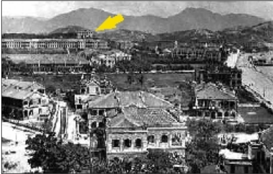
Figure 3: Panoramic view across the Tsim Sha Tsui area showing the Hong Kong Observatory (yellow arrow), high on the hillside above the harbour.

It would be some time before Doberck could return to these double star studies, but return he eventually did, both in Hong Kong and later, during his retirement, in England.