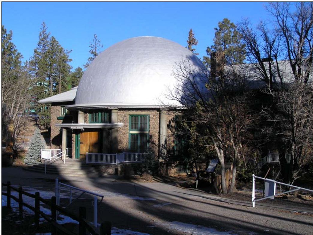
Figure 7: A recent view of the Slipher Building at the Lowell Observatory.