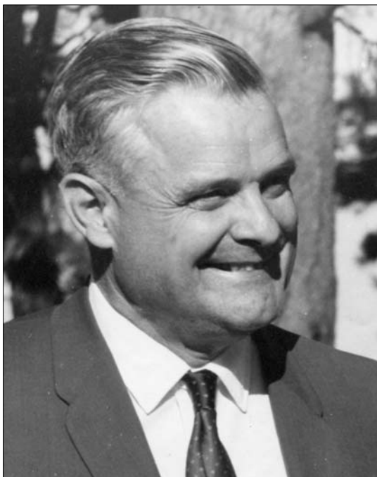
Figure 6: John S. Hall (1908–1991) was at the Lowell Observatory from 1958 to 1977 (Director: 1958–1977).

Since Hall wanted to finish some projects at USNO, the effective date of his appointment was put off to 1 September 1958.