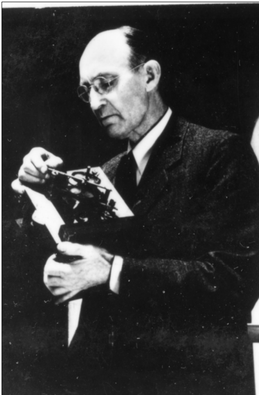
Figure 3: C.O. Lampland (1873–1951) was at the Lowell Observatory from 1902 to 1951.