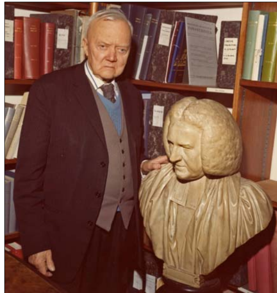
Figure 10: Dr Ernst Öpik in the Armagh Observatory Library.