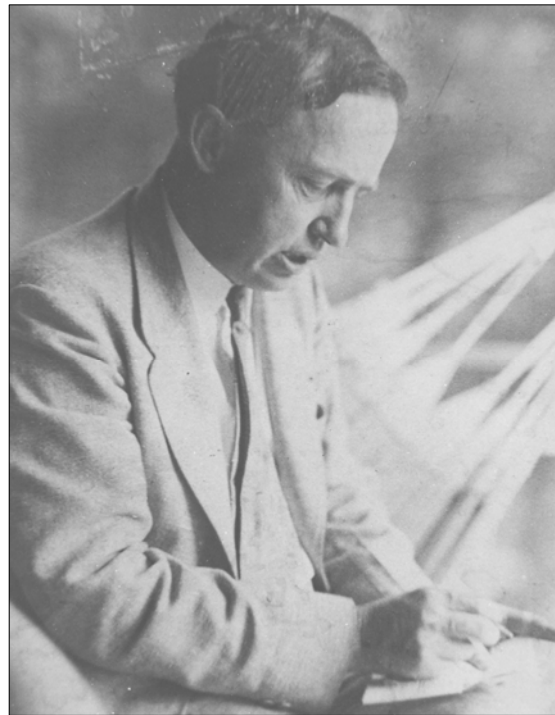
Figure 9: Dr Harlow Shapley at Harvard, in 1932.