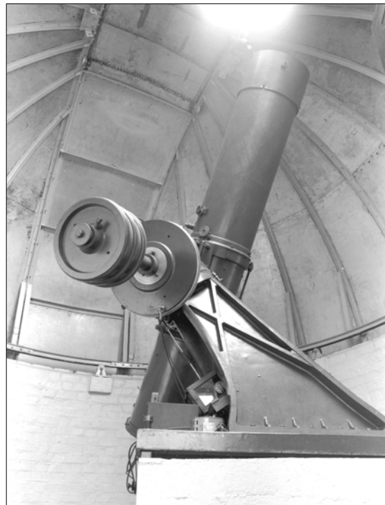
Figure 5: The 12/18-inch Schmidt camera at Armagh (in the 1980s) (Corvan Collection).

It was Dr Lindsay's strong belief that the home observatory should have small, but effective, instrumentation to take full advantage of any interesting objects that might appear in the sky, such as comets, novae or unusual variable stars. I remember once being invited to take part in a programme to search for Wolf-Rayet stars in Cygnus, using the Armagh Schmidt camera (Figures 5 and 6). Unfortunately, I had to decline this offer due to the nature of my employment. In those days the skies at Armagh were quite dark, unlike today, and it was easy to count at least 13 stars in the Pleiades star cluster with the naked eye. To give another example of just how good the conditions were in those days: on two separate occasions I had no difficulty in spotting the planet Uranus and the two main satellites of Jupiter without optical aid. And, of course, useful observations were still possible with small telescopes (see Figure 7).