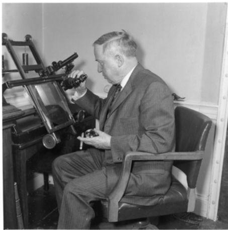
Figure 3: Harlow Shapley at Armagh Observatory in April 1959, with the binocular microscope on loan from Harvard College Observatory.