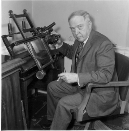
Dr. Shapley at the binocular microscope for studying photographic plates. This instrument, used at the Observatory on loan from Harvard College Observatory, to aid in a programme on galactic structure, April 1959.