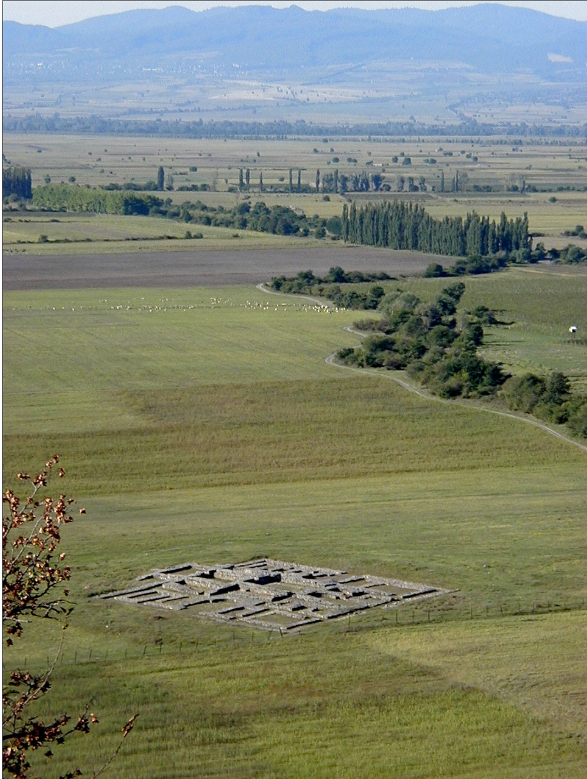
Figure 1: View of the excavated Nekresi Temple from Nazvrevi Hill.

building was 9.5m, and the walls were 1.5m thick. The eastern and western buildings were almost equal in area, and only differed in the details of their construction. The northern and southern buildings leading off the central building were also surrounded by corridors and storerooms. The central building, the four buildings to the north, south, east and west, and their associated corridors and storerooms were all enclosed by a wall, the entire complex measuring ~50m × 50m.