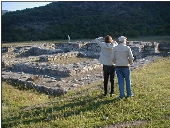
Figure 2: View across the archaeological site showing the stone construction of the walls.

On the basis of the accumulated evidence, Chilashvili (ibid.) concluded that this archaeological site is the remains of a temple where rituals associated with fire-worship were performed, and he dubbed it the 'Nekresi Fire Temple'. The main 'area of attraction' was the centrally-positioned square building with its altar, which served as a sanctuary for the fire-worshippers during their ceremonies.