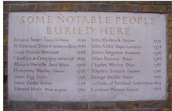
Figure 2: The plaque in the Old Church Garden off Marylebone High Street commemorating notable individuals, including Ferguson, buried in the churchyard.

I visited the Old Church Garden, Marylebone in October 2010 by chance. I was in London on other business and in Marylebone High Street by accident. I saw the sign for the garden, went in, found the plaque and returned the following day to take photographs. The plaque commemorates "... some notable people buried here ...", including "James Fergu-