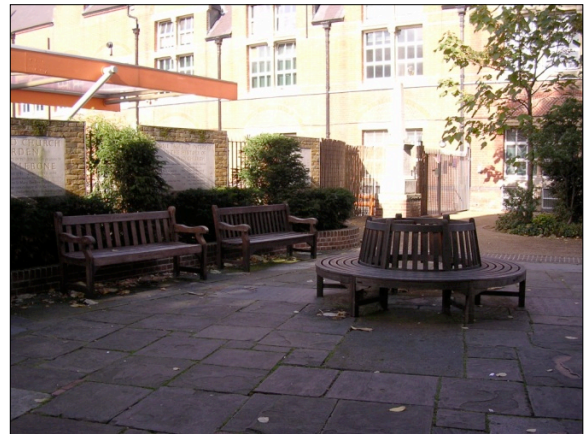
Figure 3: A view of the Old Church Garden off Marylebone High Street.

son Astronomer 1776". Figure 2 shows the plaque and Figure 3 a view of the Garden. Both were taken on Sunday 24 October 2010.