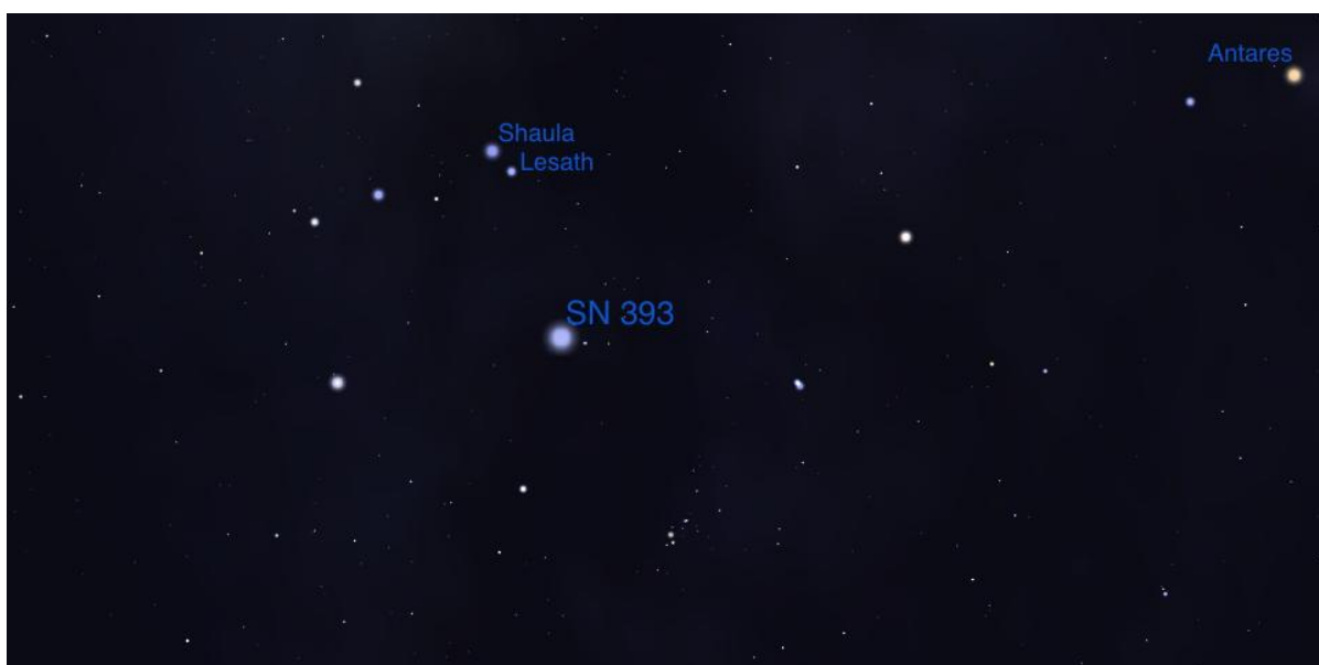
Figure 3: SN 393 as seen in the tail of Scorpius near the stars Shaula and Lesath (image from Stellarium, with labels added by the author).

We are certain that ancient and indigenous people witnessed novae and supernovae, and we strongly believe that these events were incorporated into their oral traditions and possibly material culture. There is only solid evidence that the Boorong people of western Victoria noted the Eta Carinae supernova-impactor event in the 1840s and incorporated it into their astronomical traditions (Hamacher and Frew, 2010). Without the written information pro-