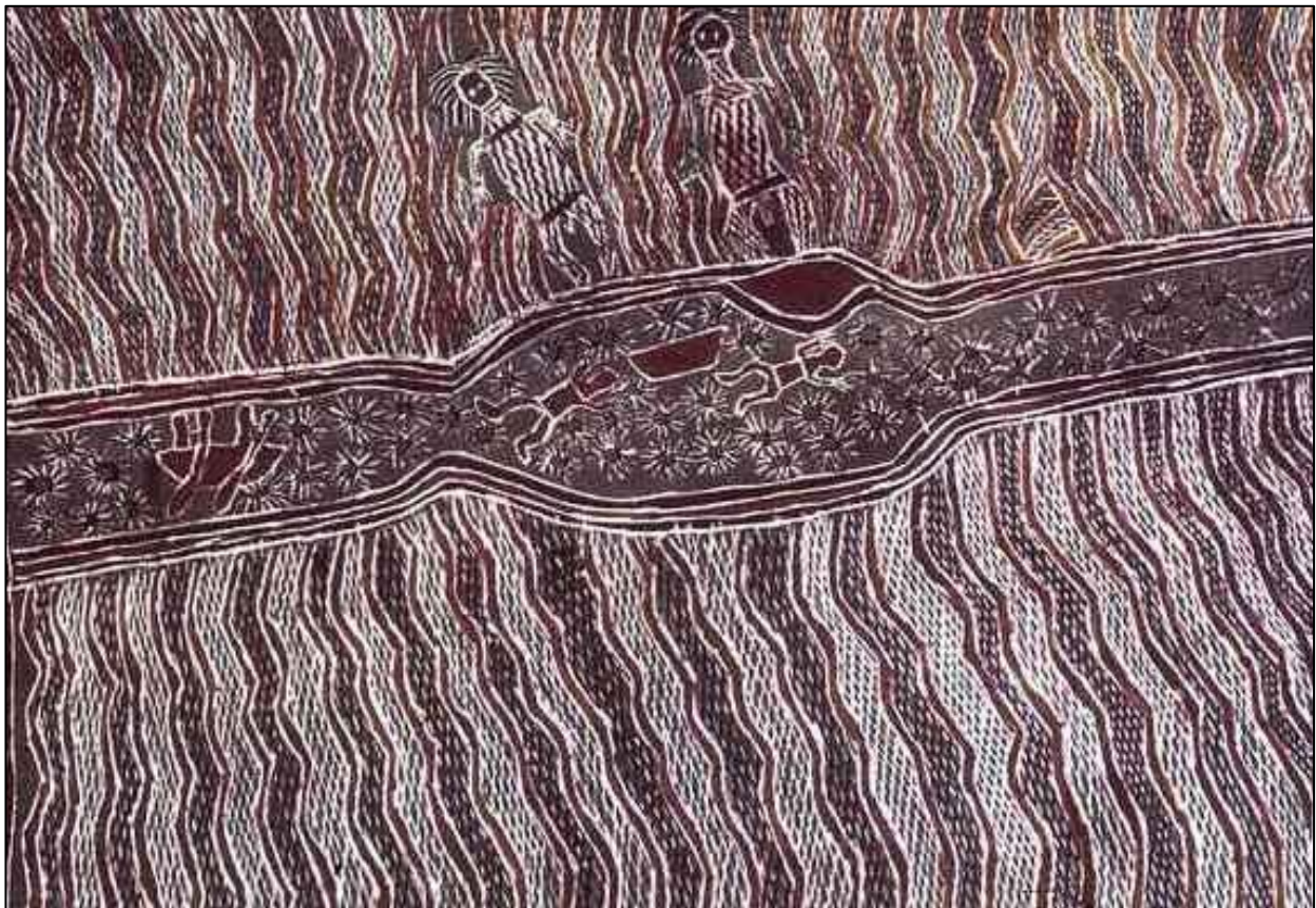
Figure 2: A Yolngu bark painting of the Fisherman Brothers in the Milky Way (after Mountford, 1956: 499, Plate 157-A (cropped); see, also, Plate 157-C).

Variations of the story are found across Arnhem Land. Mountford (1956: 496-499) cites a similar identical story from Blue Mud Bay, Arnhem Land. In this account, two brothers are fishing in a bark canoe near Woodah Island, northwest of Groote Eylandt off the southeastern coast of Arnhem Land. On their way home, a storm hit and the waves capsized the brothers' canoe. In this account, the younger brother ( Jikawana ) dies first, followed by the older brother ( Nungumiri ). The story of the brothers' demise is reflected in the sky. The brothers, the fish and their canoe are seen as dark absorption nebulae (‘starless spaces’) in the Milky Way. According to Mountford (1956: 498), the younger brother is a dark nebula in the Milky Way within the constellation Serpens, and the elder brother is a dark nebula near Sagittarius. The rock on which the elder brother collapsed is seen as a portion of the Milky Way near Theta Serpens, and their canoe is represented by a line of four small stars near Antares (Alpha Scorpii). This story is represented in Aboriginal bark paintings from Arnhem Land (see Figure 2).