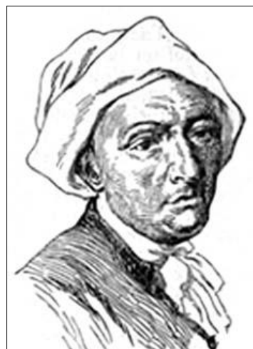
Figure 2: An engraving of de la Hire made during his lifetime (en.wikipedia.org).

The circle with 179 numbered slots on the middle disk is arranged as follows: