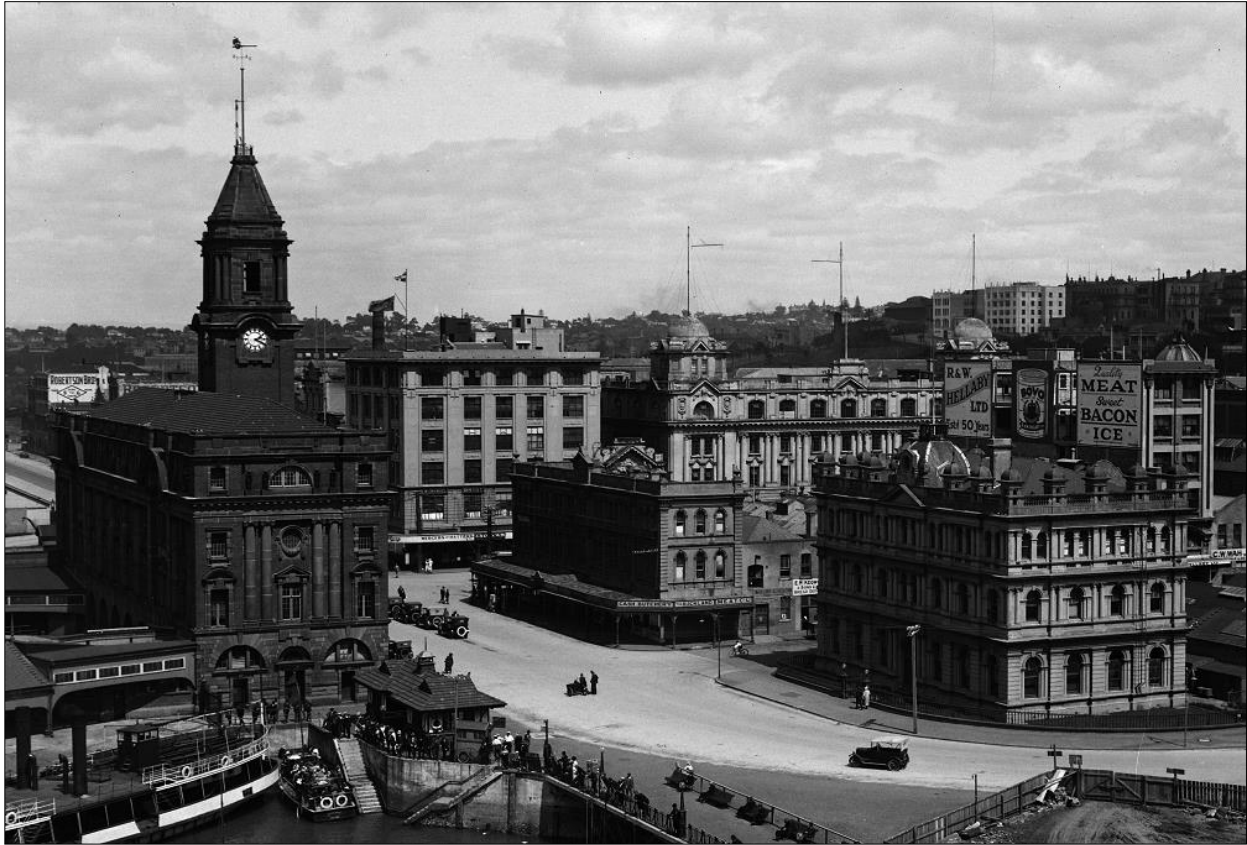
Figure 7: Looking south east from Princes Wharf 22 December 1923, showing the Ferry Building on the left (courtesy: Sir George Grey Special Collections, Auckland Libraries, W614).

Auckland Harbour Board building served as a time signal. The signal was discontinued from 1900 until January, 1915 [sic], when the ball was used on the Ferry Building tower, being dropped daily at 1 p.m. The present electric light system was substituted in the following October. Although the ball and light signals with their visibility over a considerable distance, formed a very practical aid to mariners for adjustment of chronometers, the frequent radio time signals have naturally been found more convenient.