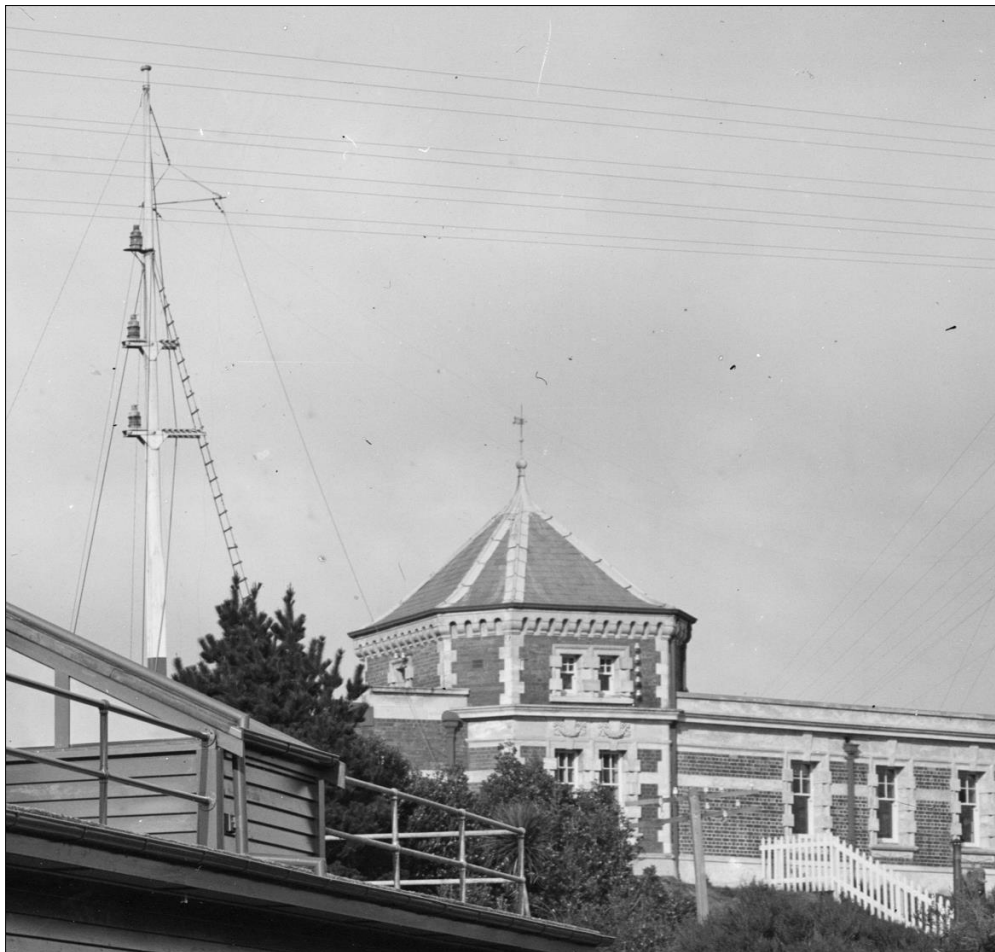
Figure 4: Detail from a 1930 photograph showing the time lights and part of the Dominion Observatory.

Figure 5 shows the layout of the Dominion Observatory buildings and time lights in 1935, from a different aspect. This is a detail from an aerial view of Kelburn and Wellington Botanic Garden. The Meteorological Office building is in the foreground.