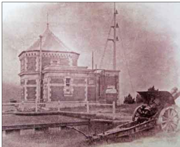
Figure 2: Dominion Observatory, about 1920 (courtesy: Friends of the Wellington Botanic Garden).

HECTOR OBSERVATORY, WELLINGTON. Latitude 41deg 17min 3.76sec south. Longitude 11hr 39min 4.27sec east of Greenwich. Height above 1909 mean sea level, 418 feet. CHRONOMETER RATING NOTICE. At 1 p.m. to-day a galvanometer signal for rating chronometers will be sent from the Observatory to the Public Telegraph Office, and to the Dominion Museum. The needle will move at 1 p.m. exactly of New Zealand standard mean time, when a chronometer set to Greenwich mean time should show 13hr 30min. Any difference will be the error of the chronometer on Greenwich mean time. At 9 p.m. correct time will also be signalled from the Observatory by means of electric lights. A green light will be switched on at about 8.45 p.m., a red one at about 8.55 p.m., and a white one at about 8.59 p.m., and all lights will be switched off at 9 p.m. exactly of New Zealand standard mean time. The preparatory switching on of