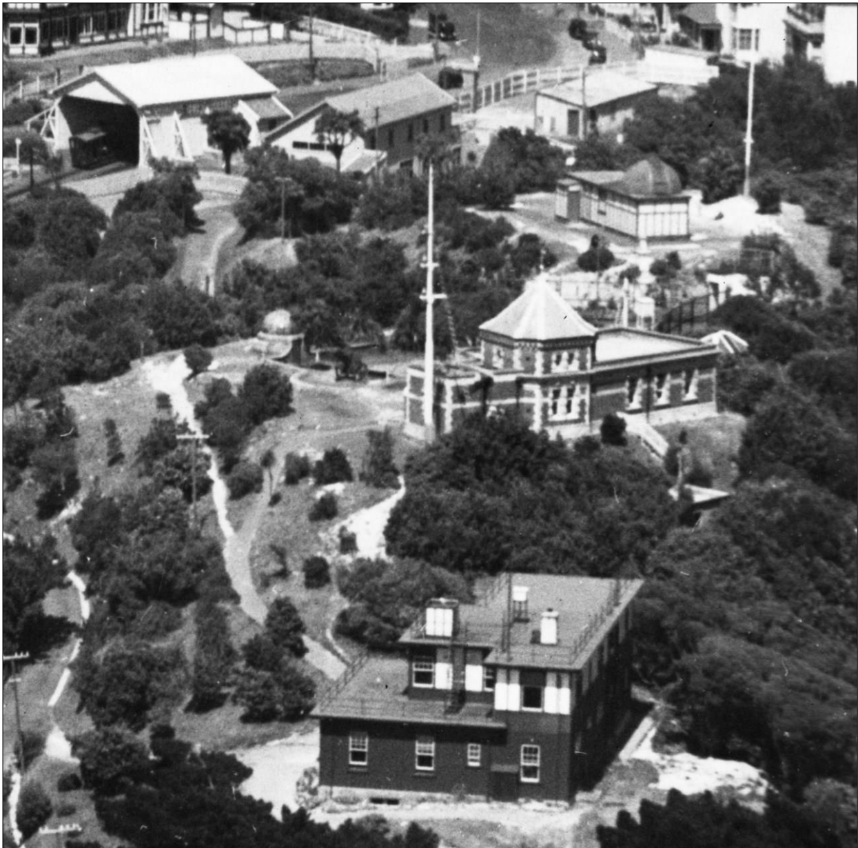
Figure 5: The upper Botanic Garden, circa 1935.